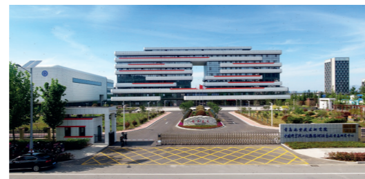
青岛航空技术产业基地

Industrialization of light-duty gas turbine engine achievements