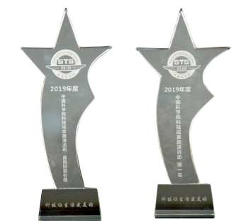
中国科学院 STS 双创项目成果路演“第一名”和“最具投资价值奖”

In response to the urgent need for power plants such as UAVs and general-purpose aircrafts, this achievement puts forward the theory of flow and combustion stabilities in aeroengine at high altitude low Reynolds number, and invents the time-sharing and partitioned evaporation tube combustion technology, which solves the flameout and narrow range of stability at high-altitude. This achievement proposes the high-stability compression in confined spaces and wake coupling low-pressure turbine technology, which solves the engine instability, component performance degradation and fuel consumption increase at high altitude low Reynolds number; the overall layout of light-duty aeroengines is proposed, which solves the problem of complex engine system and high cost. After 16 years of independent innovation, a series of key core technologies were broken through and a series of light-duty turbine engines was developed, which are applied in batches to new generation UAV and cruise system, forming basic research, key technologies, and engineering applications. The innovation of the whole chain to industrialization has promoted the transfer and transformation of achievements and large-scale industrialization.